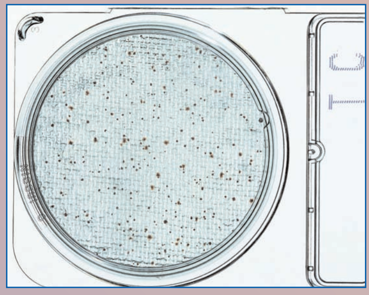
Fig 1: Compact Dry TC