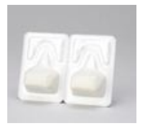
EC Blue 100 P

The optional tool ECBlueQuant provides a rapid and simple method of quantifying coliforms and E.coli in the form of an MPN test.