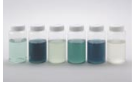
Positive samples in natural light Coliform bacteria produce the ß-galactosidase enzyme, which then cleaves the synthetic substrate X-GAL contained in the ECBlue and simultaneously releases a blue/blue-green dye.