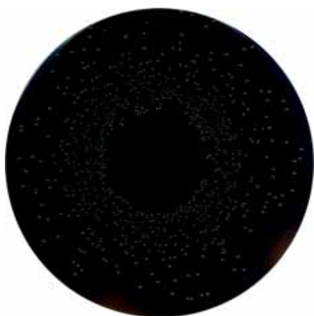
Enterococcus faecalis ATCC 19433