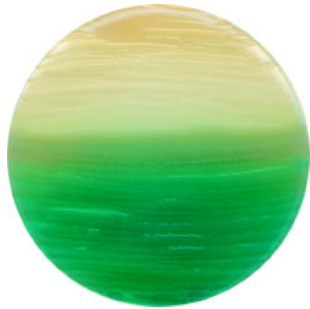
Pseudomonas fluorescens ATCC 13535 und Pseudomonas aeruginosa ATCC 25668